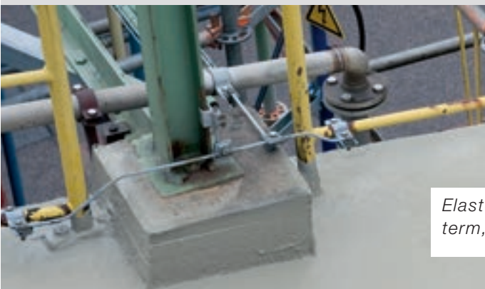
Elastocoat seals long-term, without joints.

® = registered trademark of Elastogran GmbH