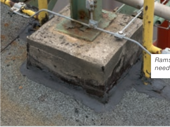
Ramshackle, roof in need of repair.

Damaged seals let moisture penetrate the roof. With disastrous consequences: concrete corrosion, long-term weakening of the structure of the entire building, irreversible damage to valuable interiors. And the formation of mildew, which is expensive to remedy, threatens the health of the occupants. But leaking roofs are not God-given, they are preventable; with Elastocoat.